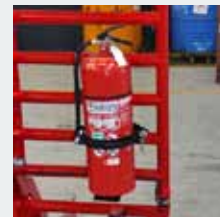
Fire extinguisher bracket mount