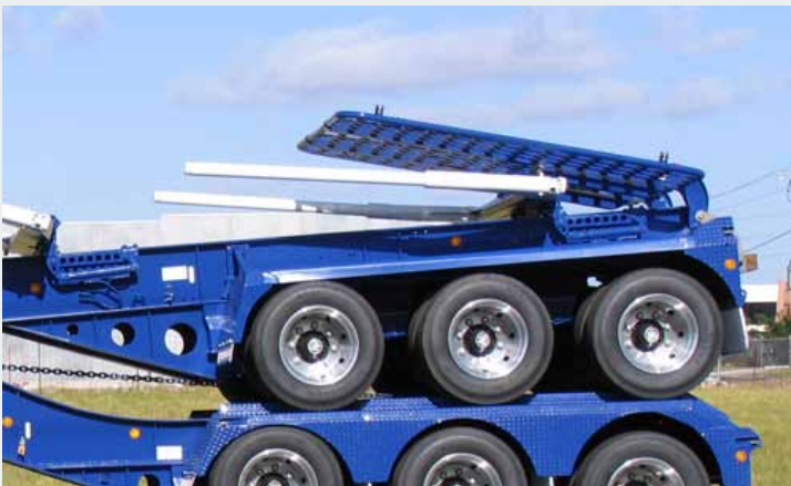
Optional compact folding when empty.

Ensures no overlength loads and improves public safety. Designed for maximum strength and light tare weight.