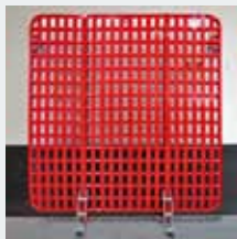
50mm spaced vertical straps