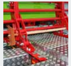
Broom/Rake holding bracket

P:\Brochures\Cabguards\Cabguard Brochure V-2.indd