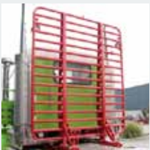
Plain guard with horizontal straps