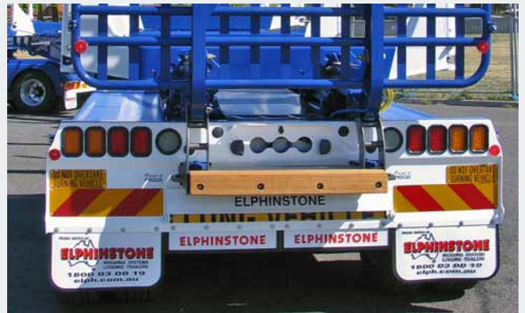
Rear push bar (wooden or rubber options)