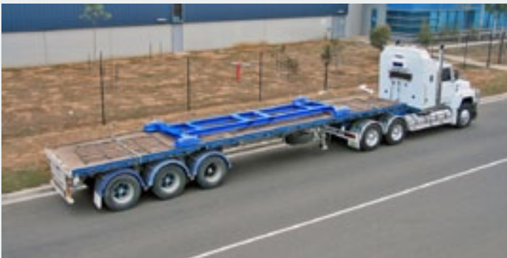
Sits securely on any hard flat surface