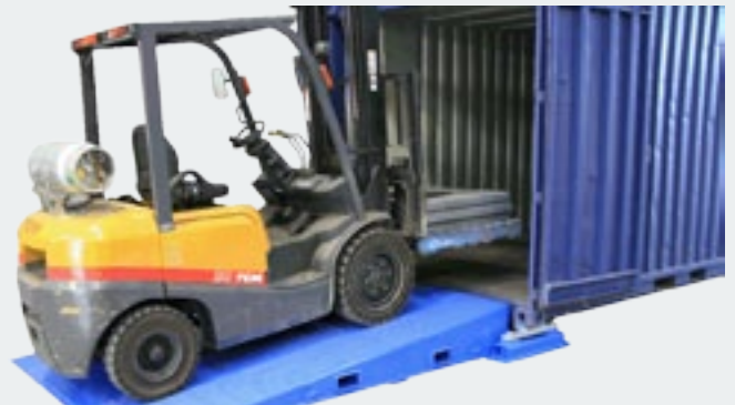
Load container with forklift via forklift ramps that lock into frame