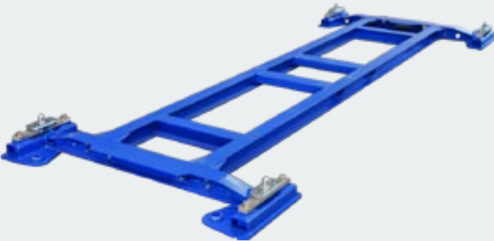
Containina Weigha frame with loadcells mounted at corners

Elphinstone "Containina Weigha" features a rugged frame with integrated loadcells offering simple, portable weighing for ISO shipping containers