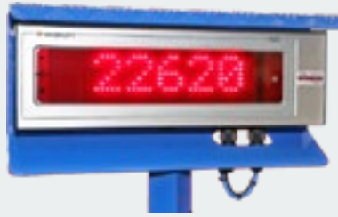
LED outdoor scoreboard