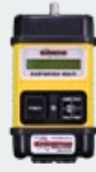
Easyweigh Multi radio remote