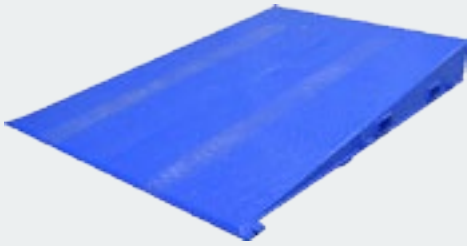
Forklift ramp, 2.4m full width