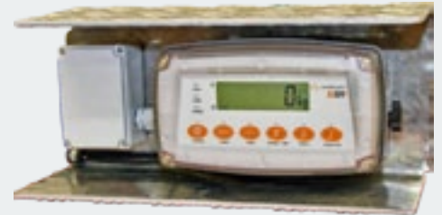
X320 Weatherproof indicator