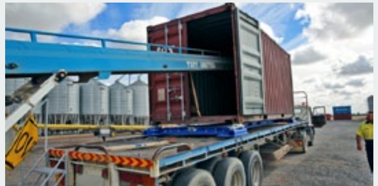
Weigh while loading

P:\Brochures\Containina Weigha\Containina Weigha Brochure V-2.indd