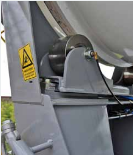
Loadcells mounted under rear rollers

Accurate load weight at all times. Measure carry back (displayed in KGs or M 3 ). Measure buildup for de-dagging.