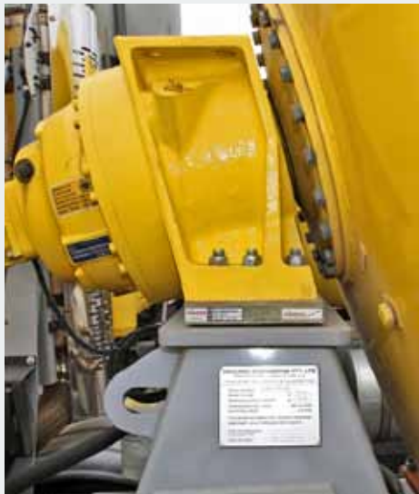
Loadcell mounted under gearbox