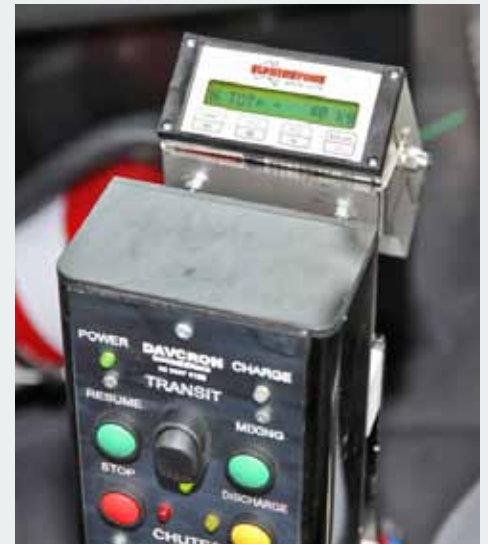
Cab mounted display

Connection to GPS and fleet dispatch/management systems for live monitoring