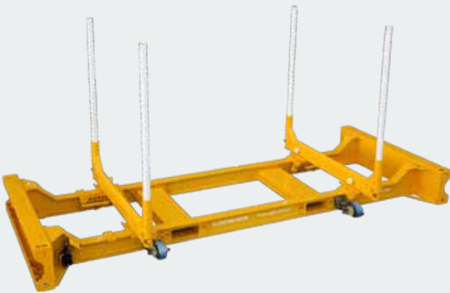
Bolster assemblies raised

Connect to standard container rail wagons by twist locks. Easy maneuvering of frames by fork pockets. Manual hydraulic raise / lower bolster assemblies.