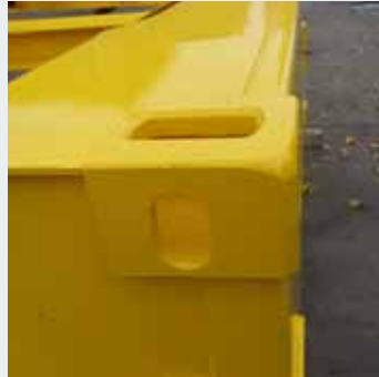
Twist lock corner mounts