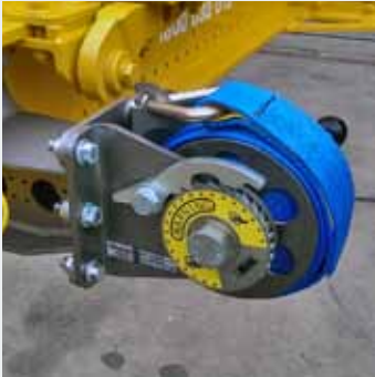
Manual load binder winches