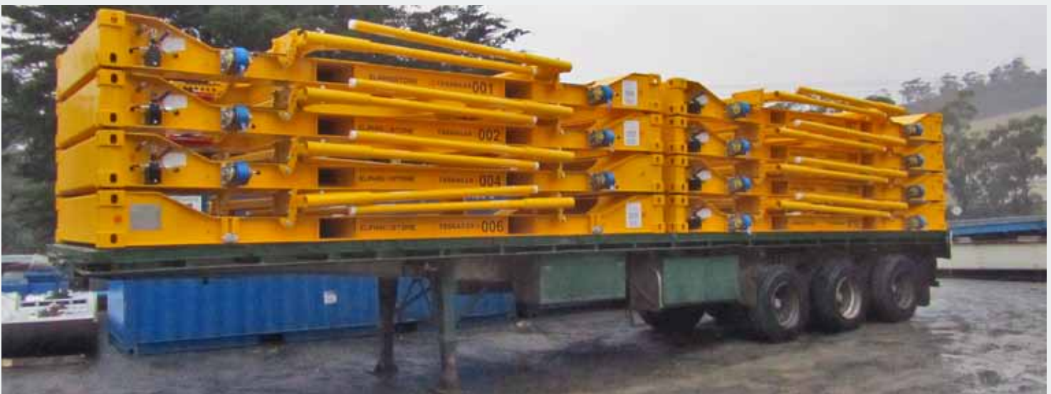
Road Railer bolsters folded down allows two 20ft or one 40ft shipping container to be affixed on top of the frames

Portability is maintained as Road Railer fits onto skeletal trailers.