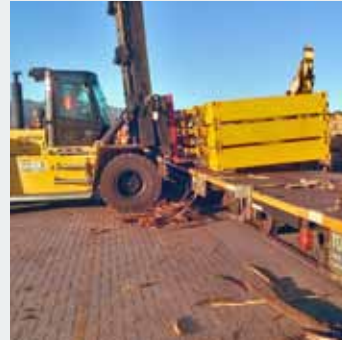
Portable via forklift