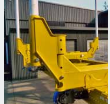
Optional bolster widening extensions

Road Railer is a versatile and cost effective solution to the log transport industry whether by road or by rail.