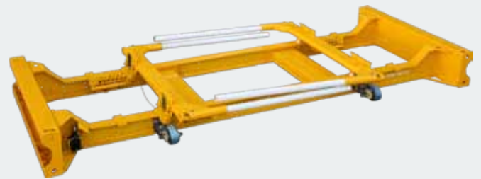
Bolster assemblies lowered