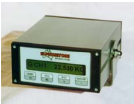
Elphinstone D Model (Cab Mount Indicator)