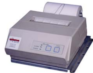
Elphinstone L5500 (Cab Mounted Printer)

Specifications subject to change without notice