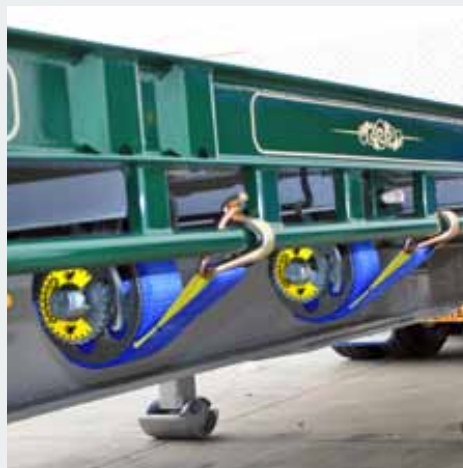
Under Tray Mounted